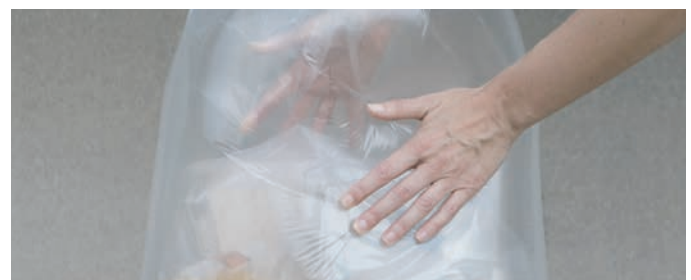
Example of double-bagging items.